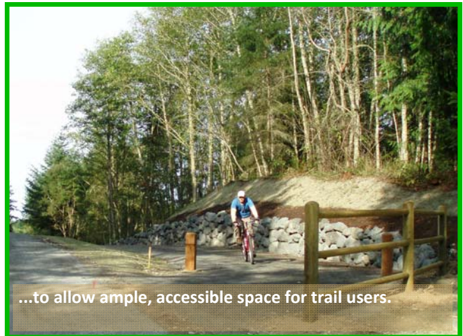
...to allow ample, accessible space for trail users.