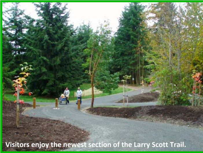
Visitors enjoy the newest section of the Larry Scott Trail.

Jefferson County Public Works has constructed the newest section of the Larry Scott Trail, adding over one mile of trail to the 4.4 trail miles already built. The new trail section extends southward along S. Edwards Rd beginning at milepost (MP) 4.0 and joins existing trail that extends from MP 4.4 to MP 4.8. From MP 4.8, newly constructed trail continues to MP 5.6. Shold Construction, Inc. of Port Hadlock cleared, graded and graveled 6,500 linear feet of new trail, constructed rock walls where required, and installed rail fencing and timber bollards. County forces completed the project with planting and signage installation.