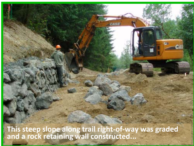
This steep slope along trail right-of-way was graded and a rock retaining wall constructed...

With this segment completed, Public Works will prepare for the next trail development project as funds allow. Thanks to the 2009 grant from RCO and Federal Enhancement Grant funds, trail right-of-way has been acquired from the trail's intersection with S. Discovery Rd to its terminus near Milo Curry Rd. When complete, the non-motorized Larry Scott Trail will extend eight miles from the City of Port Townsend to the Four Corners area.